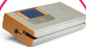
EM 30 KLC

The Entrhal Sealers: safe, compact, and easy to operate!