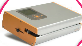
EM 20 KLC